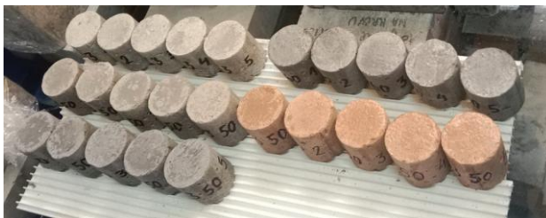
Figure 1: Test specimens, prepared for combustibility test

The cylindrical test specimens, five of each series, having a diameter of (45 \pm 2) mm and a height of (50 \pm 3) mm, were prepared, as illustrated in Figure 1.