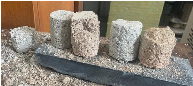
Figure 3: Test specimens after the combustion process

Figure 3 depicts the specimen following the combustion process. The majority of test specimens retained their cylindrical shape following the test; nonetheless, their structure was friable and prone to collapse. It should be emphasized that no persistent blazing or consistent blue-coloured luminous gas zones were detected during the test. All evaluated specimens showed no sustained flame, indicating that all mortar combinations met the threshold for the A1 fire reaction class ( t_f = 0s ).