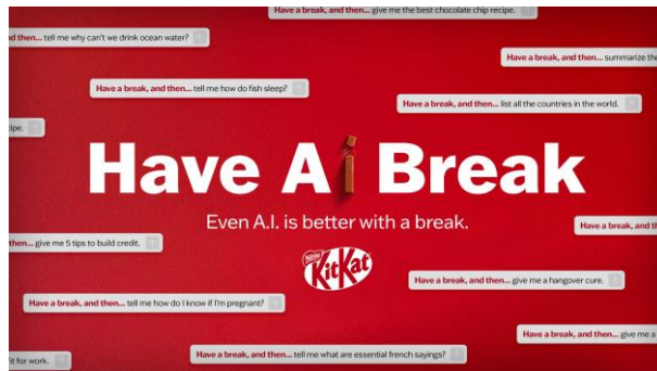
Figure 2: Have AI Break. Have a Kit Kat.

The "Have A(i) Break" campaign by Kit Kat was inspired by research conducted by Google DeepMind, which revealed that even artificial intelligence performs better when given a break (CourageInc., 2024). Researchers found that the phrase "Take a deep breath and solve the problem step by step" was the most effective in improving AI performance. The agency Courage connected this finding with Kit Kat's iconic message "Have a break," adding the phrase "Have a break, then..." to a series of AI prompts (Fig. 2). The improved and more accurate responses demonstrated that Kit Kat's "Have a break" ethos, or in this case "Have an 'AI' break," resonates even with artificial intelligence.