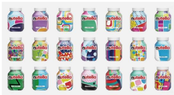
Figure 4: Nutella's AI-Designed Labels Campaign

Nutella launched the " Nutella Unica " campaign, utilizing an algorithm to design 7 million unique labels (Possaible, 2023). Each label featured a combination of lines, shapes, dots, and zigzag patterns, generated by a program ensuring no two labels were identical (Fig. 4). The campaign, launched in February 2017, resulted in a quick sellout of all products. The algorithm also generated a custom ID code for each label to guarantee its uniqueness. This campaign demonstrates how AI can enhance creative processes in the design industry, showcasing the potential of intelligent automation.