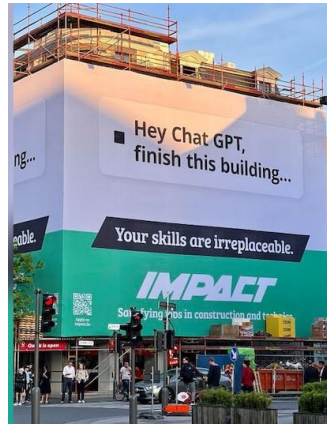
Figure 3: Your Skills are irreplaceable - IMPACT HR

Nutella launched the " Nutella Unica " campaign, utilizing an algorithm to design 7 million unique labels (Possaible, 2023). Each label featured a combination of lines, shapes, dots, and zigzag patterns, generated by a program ensuring no two labels were identical (Fig. 4). The campaign, launched in February 2017, resulted in a quick sellout of all products. The algorithm also generated a custom ID code for each label to guarantee its uniqueness. This campaign demonstrates how AI can enhance creative processes in the design industry, showcasing the potential of intelligent automation.