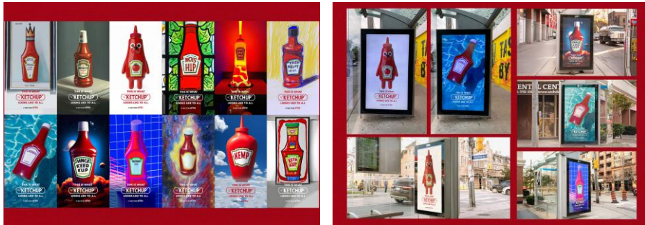
Figure 1: Heinz AI Ketchup

The "Have A(i) Break" campaign by Kit Kat was inspired by research conducted by Google DeepMind, which revealed that even artificial intelligence performs better when given a break (CourageInc., 2024). Researchers found that the phrase "Take a deep breath and solve the problem step by step" was the most effective in improving AI performance. The agency Courage connected this finding with Kit Kat's iconic message "Have a break," adding the phrase "Have a break, then..." to a series of AI prompts (Fig. 2). The improved and more accurate responses demonstrated that Kit Kat's "Have a break" ethos, or in this case "Have an 'AI' break," resonates even with artificial intelligence.