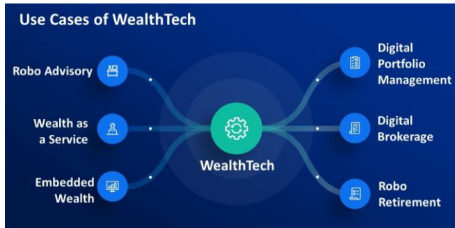
Figure 2: Use Cases of WealthTech

Figure 2 shows one example of the Use Cases of WealthTech.