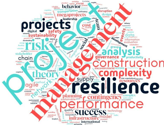
Figure 3. Visualised distribution of keywords

After content analysis of the selected articles, it has been concluded that their main research topics could be divided into three groups: