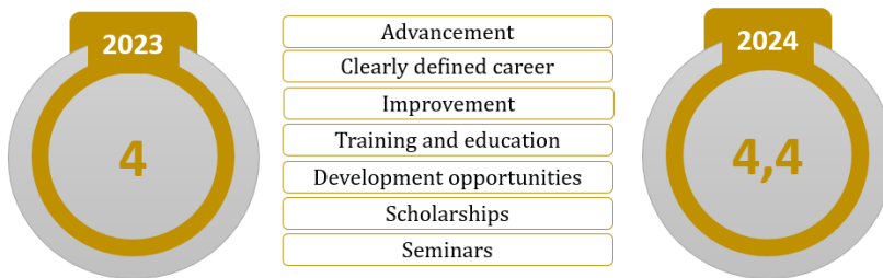
Figure 2. Rating of employee satisfaction in 2023 and 2024 caused by opportunities for professional development and advancement

The opportunity for professional development and advancement was rated with an average score of 4 in 2023, while in 2024, this score increased to 4.4, as shown in Figure 2.