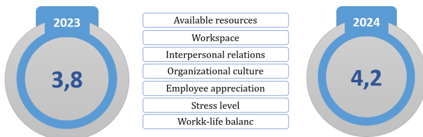
Figure 1. Rating of employee satisfaction in 2023 and 2024 caused by the work environment

BB Trade LLC – DTL PerSu markets, who evaluated the work environment as a factor of satisfaction, are presented. The average rating in the survey on a scale from 1 to 5 for the work environment was 3.8 in 2023, while it significantly increased to 4.2 in 2024. When evaluating the work environment, specific questions were defined, which related to the following factors that influence the overall work environment: availability of resources, organization of the workspace, interpersonal relationships within the company, organizational culture, employee appreciation, stress levels, and the achieved balance between private and professional life.