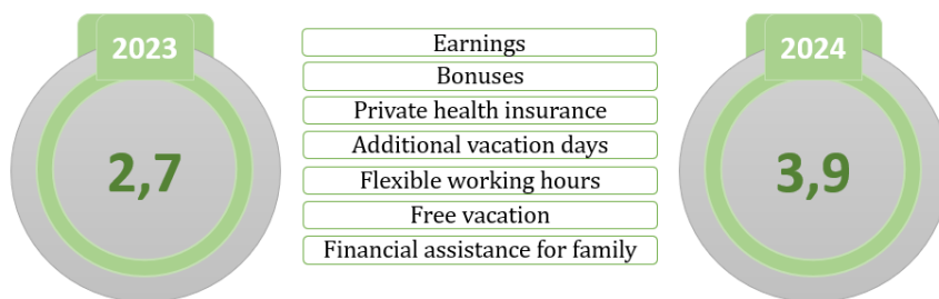
Figure 3. Employee satisfaction rating in 2023 and 2024 caused by compensation and benefits