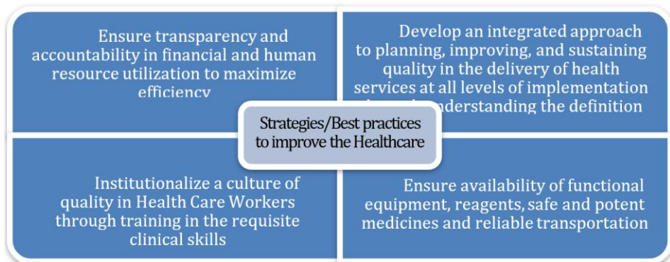
Figure 2: Research Framework

Meanwhile, Figure 2 below illustrates the research framework which demonstrates the different strategies that are being explored summarizing the common strategies which have been implored and aims to refine them. It aims to reorient healthcare delivery in which patient needs, preferences, and values honored.