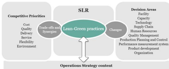
Figure 2. Relationships between the concepts, method and results

The latest research shows that Lean and Green are synergistic in most business practices, but they must be managed according to the Operations Strategy, especially as their focuses are essentially different and trade-offs may occur. Figure 2 gives a framework for Lean Green integration and emphasizes some integrated tools such as 7s which is, 5s plus S (safety) and S (sustainability) and Green Lean Six Sigma (Cherrafi, Elfezazi, Chiarini, Mokhlis & Benhida, 2016). There are some systematic studies that focus on integrated approach which can obtain the maximum operational performance without compromising the environment (Leong, et al.,2020).